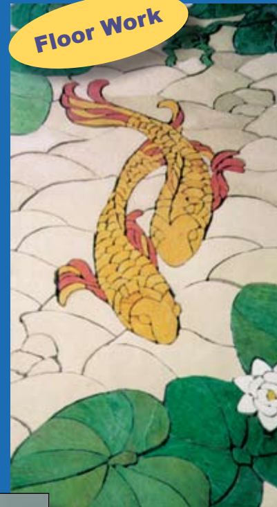
Dean & Zita Daughy - Zita Creations

“The DL7000 makes cuts that would be impossible on any other saw. It is easy to work with and sets up easy.”